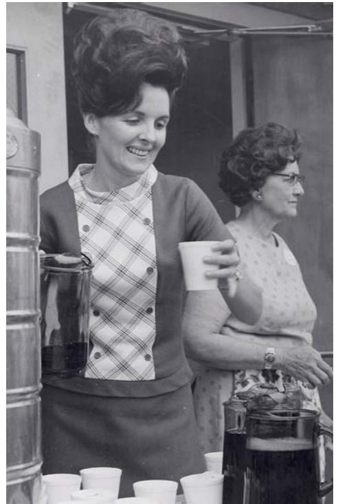
Who are these ladies? (Answer on page 9.)